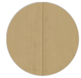
Unpainted Pressure Treated Timber