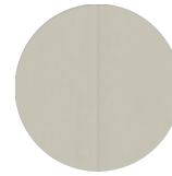
Teknos Posh Elephant