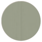
Teknos Woodland Green